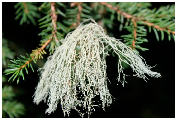
Figure 1. Photograph of Usnea longissima taken at Kanas, Xinjiang, China.

scrofula, acute mastitis, scalds, venomous snake bite, rheumatism, bruises, traumatic bleeding, and irregular menstruation [8,12–22].