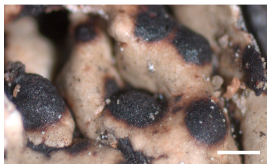
Fig. 2. Plectocarpon hypogymniae (Zhurbenko 0558). Habitus of ascomata on the thallus of Hypogymnia physodes (scale bar = 500 µm).

Specimen examined. RUSSIA. Irkutsk Region. Baikal Siberia, 2 km SE of Anchuk, Bol'shaya Bystraya River, 51°44'N, 103°29'E, elev. 700 m, Larix-Picea-Pinus taiga forest, on Hypogymnia physodes (thallus), 9 June 2005, M. P. Zhurbenko 0558 (LE 310183).