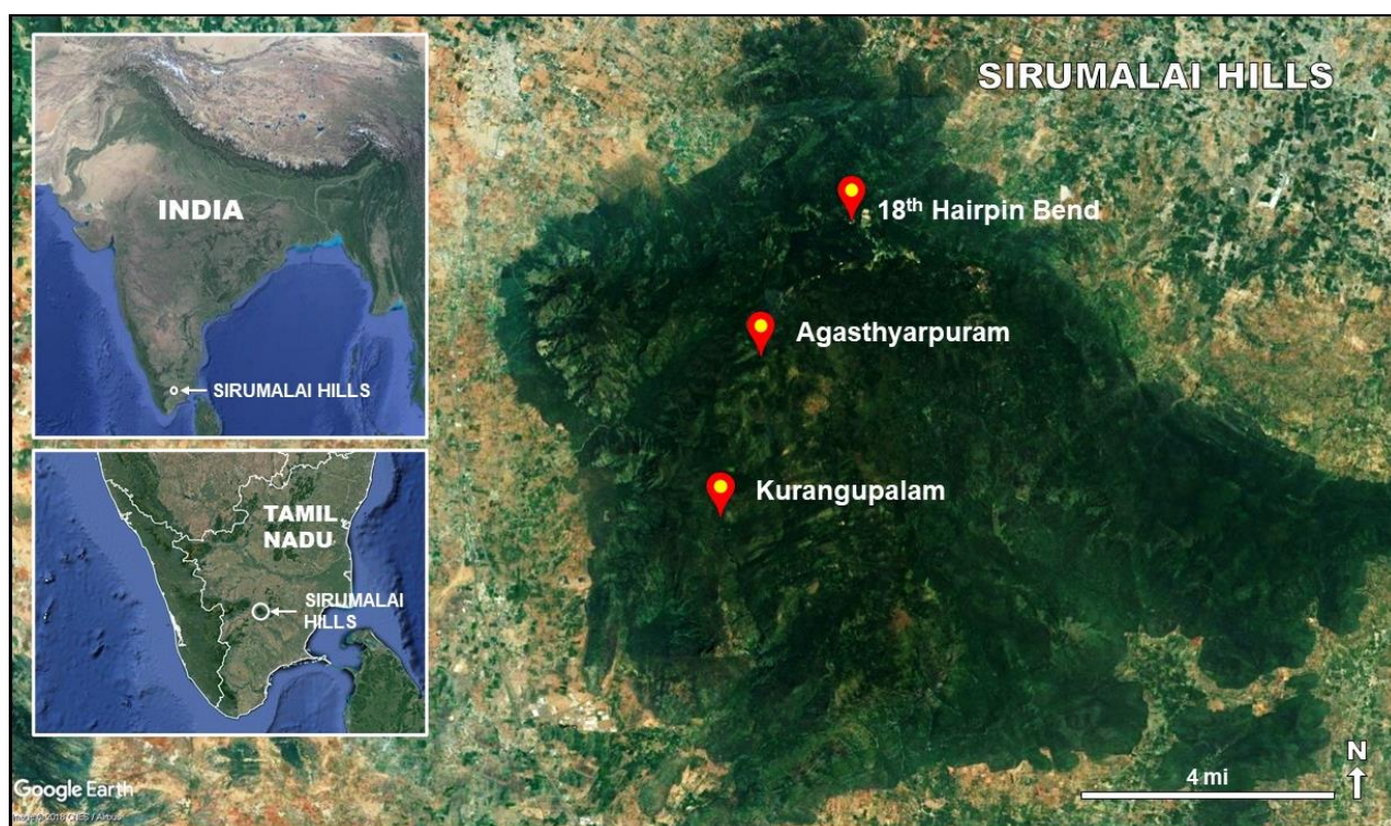
Fig. 1 – Map showing the lichen collection sites in Sirumalai hills. The top left panel of the map shows the location of Sirumalai hills within India. The bottom left panel is the enlarged portion of southern India showing the location of Tamil Nadu state and Sirumalai hills.

hottest in the hills and temperature range between 28°C to 40°C. The temperature drops significantly during winter and range between 10°C to 18°C. The months from February to August are mostly dry with occasional showers in April and May. There is a little rainfall in September, followed by the heavy showers of the north-eastern monsoon from the middle of October till the end of December. The average annual rainfall in the region is 120 to 132 cm, while the relative humidity varies from 30% to 80% (Karuppusamy 2007, Santharam et al. 2014). The area is characterized by disturbed scrub forests cover on lower hills, the dry deciduous forest at mid-elevation, and semi-evergreen forests at the higher elevation. The slopes of these hills can also be covered by savannah grassland. There have been frequent studies in this region on higher plants, including both medicinal and ethnobotanical plants. Sankar et al. (2009) reported a total of 85 plant species as new records for the Sirumalai hills, while Karuppusamy (2007) listed 90 species of medicinal plants used mainly by the 'Paliyan' tribes dwelling in the area. The altitudinal gradient, rich flora and fauna in the Sirumalai hills, indicates the possibilities of harbouring the luxuriant growth of lichens. Therefore, we surveyed this area to document its anticipated high lichen diversity.