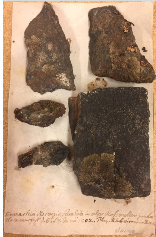
Figure 3. The holotype of Parmelia elaeina with Wahlenberg's crude inscriptions on UPS-L085536.

The correct author citation for these names are 'Wahlenberg in Acharius', as recorded by Santesson & al. (2004).