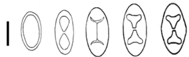
Figure 4. Ascospore ontogeny of R. malcolmii . Scale = 10 \mu m.