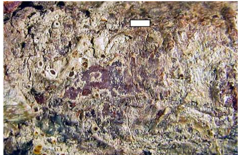
Figure 3. Rinodina malcolmii (holotype in GZU). Scale = 2 mm.