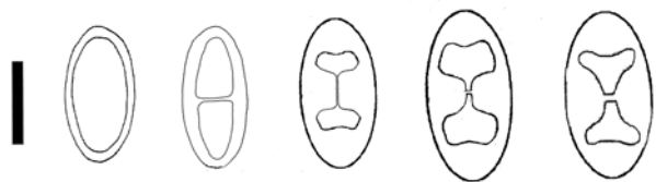
Figure 2. Ascospore ontogeny of R. fineranii . Scale = 10 \mu m.