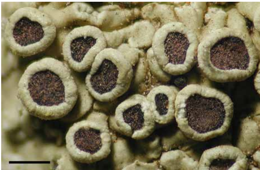
Figure 6. Dirinaria purpurascens (Kalb 21119 – herb. K.Kalb), showing the thin purplish-brown apothecial disc pruina with melanoclinin A and melanoclinin B. Bar = 0.5 mm.