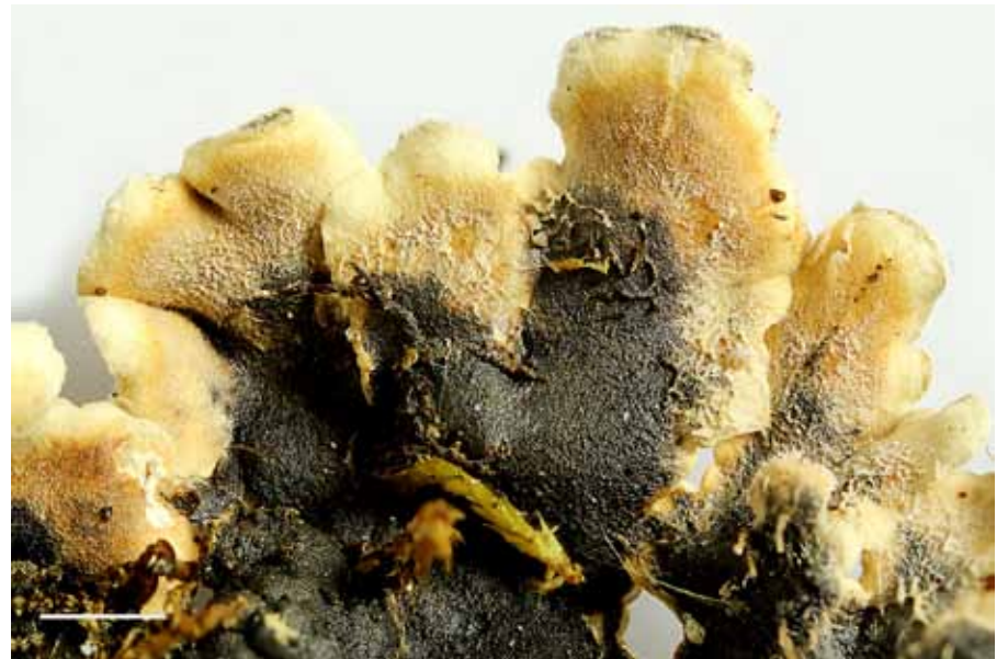
Figure 3. Dirinaria aegialita (Schumm 20315 – herb. F. Schumm); lower side of lobe apices, showing the high concentration of the ochraceous pigment diacetylgraciliformin and the hapters. Bar = 1 mm.