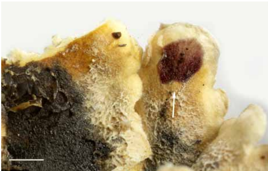
Figure 2. Dirinaria aegialita (Schumm 20315 – herb. F. Schumm); lower side of lobe apices, showing the K + purple reaction (arrow) of diacetylgraciliformin. Bar = 0.5 mm.