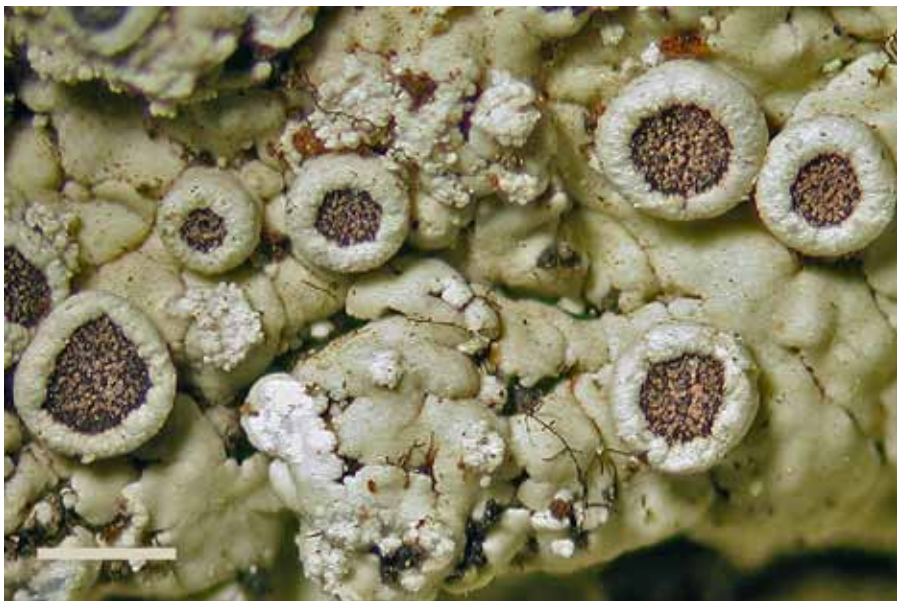
Figure 5. Dirinaria pruinosa (Kalb 26837 – herb. K.Kalb). Apothecia, showing the granular purplish brown pruina with melanoclinin A and melanoclinin B. Bar = 0.5 mm.