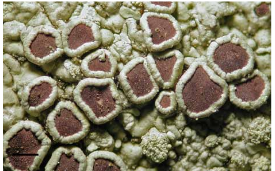
Figure 4. Dirinaria melanoclina (Kalb 33905 – herb. K.Kalb). Apothecia, showing the thick purplish brown pruina with melanoclinin A and melanoclinin B. Bar = 0.5 mm.