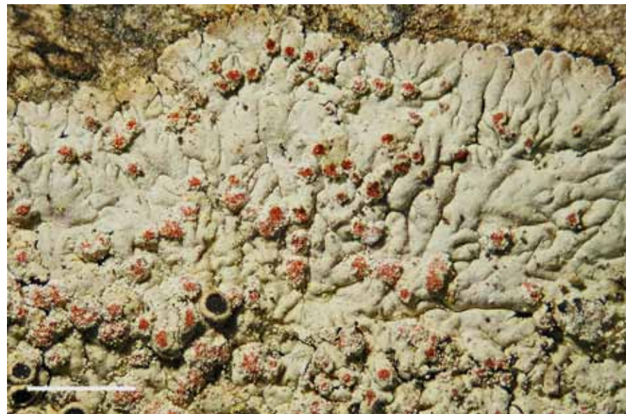
Figure 7. Dirinaria leopoldii (Kalb 11346 – herb. K.Kalb). Subdichotomously or pinnately divided lobes with flabellate apices and cinnabar-red coloured soralia, caused by a mixture of rhodocladonic acid and canarione. Bar = 2 mm.