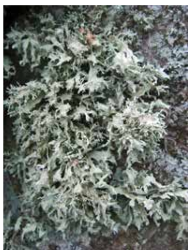
Figure 1. Ramalina canariensis is now At Risk – Declining because of observed deterioration of its population on Chatham Island.

2 TI = Taxonomically Indistinct (see Table 4).