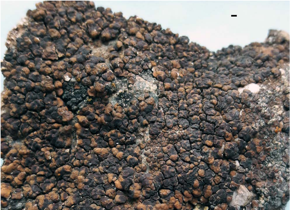
Fig. 2. Acarospora molybdina habit (scale bar = 1 mm)

A detailed descriptions of the species is given in Thomson (1997). Acarospora molybdina differs by its longer lobes and mostly sessile apothecia, but is